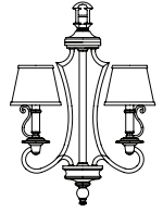
Drawing 1 - Fixture Assembly